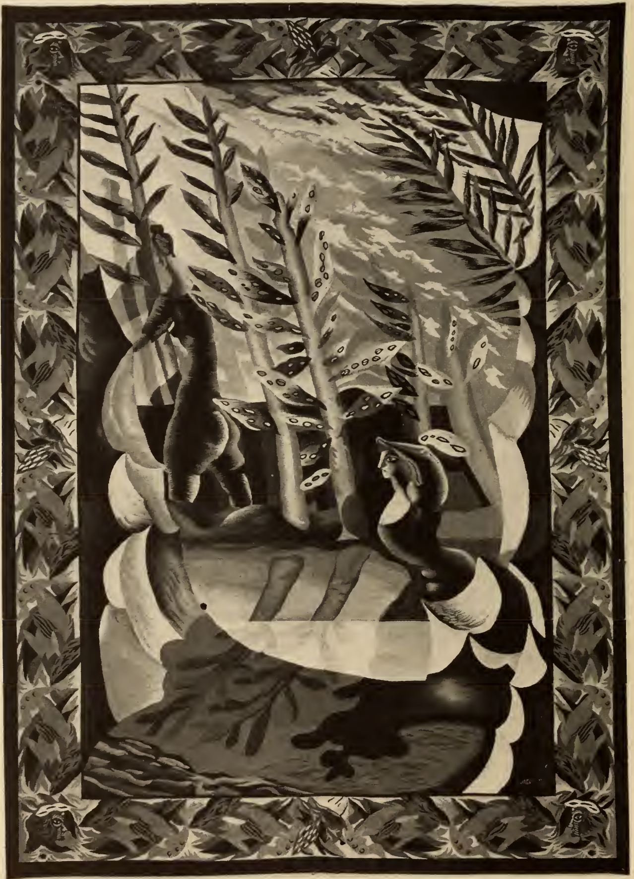
JEAN LURCAT — "L'Orage"